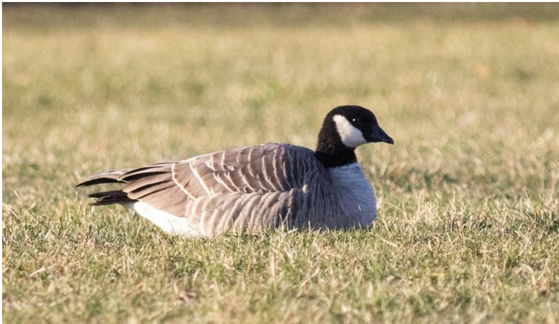
Cackling Goose 12/20/2023 Bethel Springs Elementary School, Bethel, PA ( Brian Quindlen ).