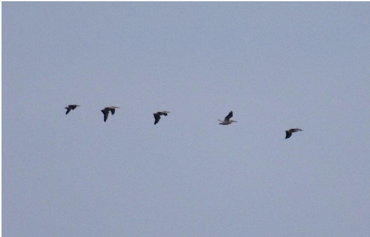
American White Pelican 6/4/2019 Haverford College, Haverford, PA.