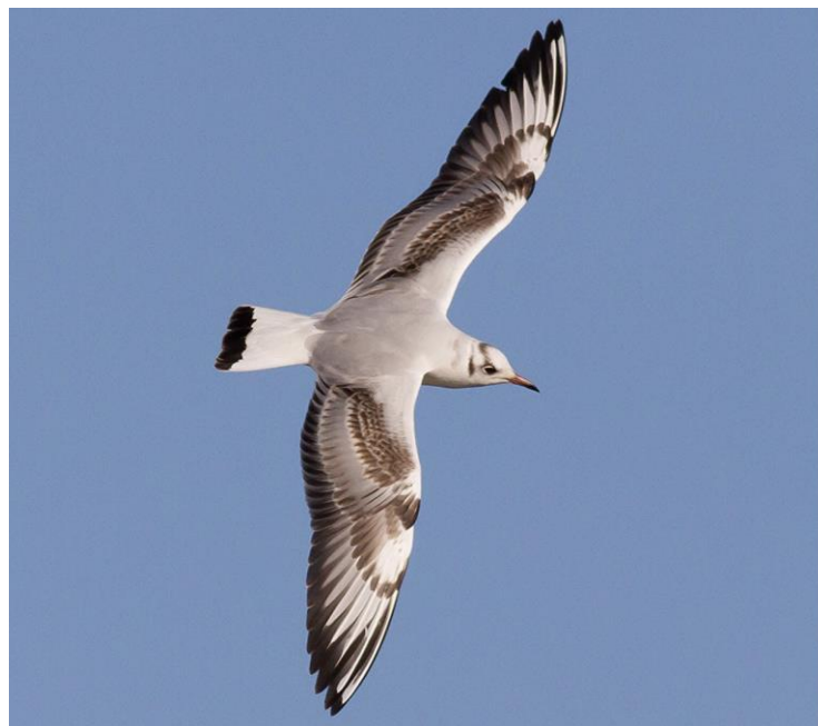
Black-headed Gull 12/27/2016 John Heinz N.W.R., PA.

A Black-headed Gull spent the winters of 2016-2017, 2017-2018 and 2018-2019 at John Heinz N.W.R. During these winters it moved back-and-forth between Delaware and Philadelphia Cos. and was seen and photographed by many birders. Rare and regular in the mid-Atlantic in winter, it should be looked for to occur again.