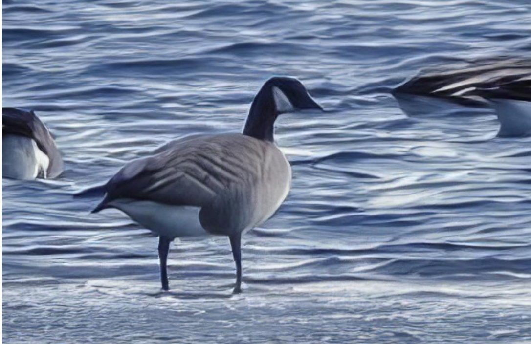
Cackling Goose 1/25/1997 Springton Reservoir, Media, PA ( Nick Pulcinella ).

In 2004 The American Ornithologist Union recognized this diminutive goose as a distinct species from its well known relative, the Canada Goose, based on genetic differences. Birders in Delaware Co. had been documenting the occurrence of this species for many years prior in anticipation of this potential split. It was first documented at Springton Res. on 1/25/1997 when one was seen within a flock of Canada Geese. Since then there have been upward of sixty documented occurrences. It is considered to be a rare, but regular migrant and winter visitor in Delaware Co. and should be looked for wherever flocks of Canada Geese winter.