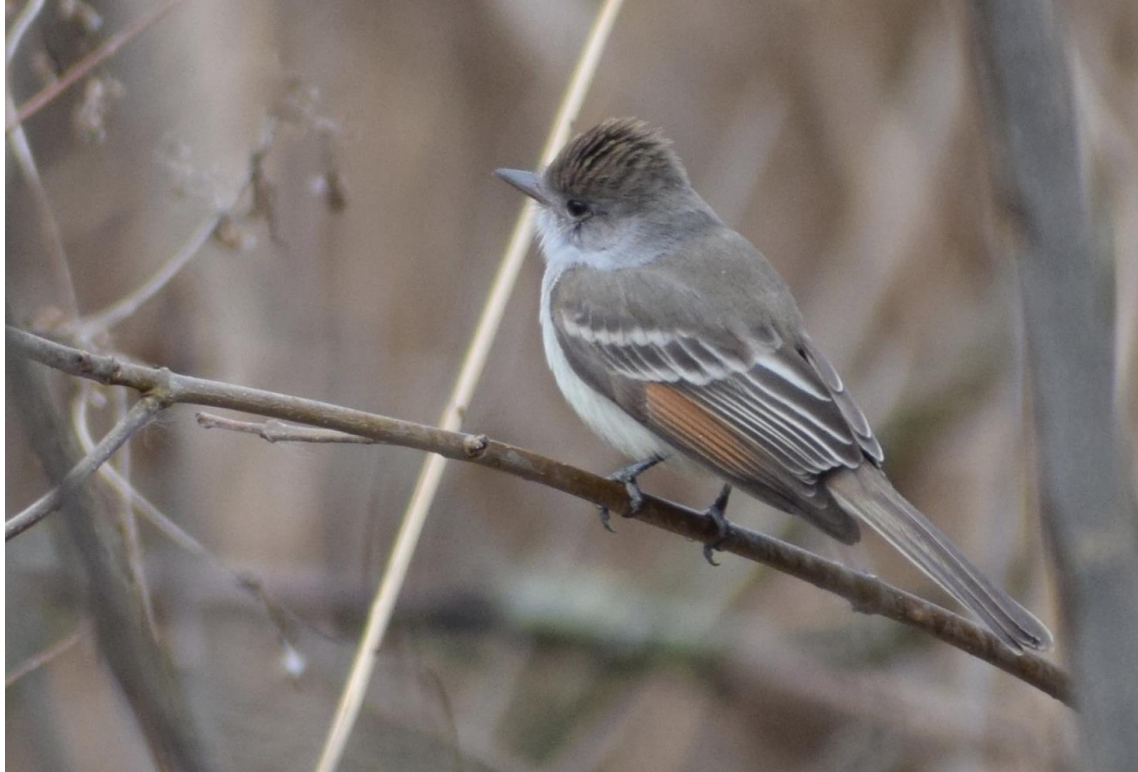
Ash-throated Flycatcher 1/13/2024 John Heinz N.W.R., PA.

Discovered in the Philadelphia Co. portion of John Heinz N.W.R. 12/15/23. The bird moved frequently across Darby Creek into Delaware Co. being first noted in Delaware Co. on 12/22/23. Last reported in Delaware Co. 1/16/24 and last reported in Philadelphia Co. 1/22/24. Fortunately, it stayed around long enough to be recorded on the Glenolden CBC 12/16/23