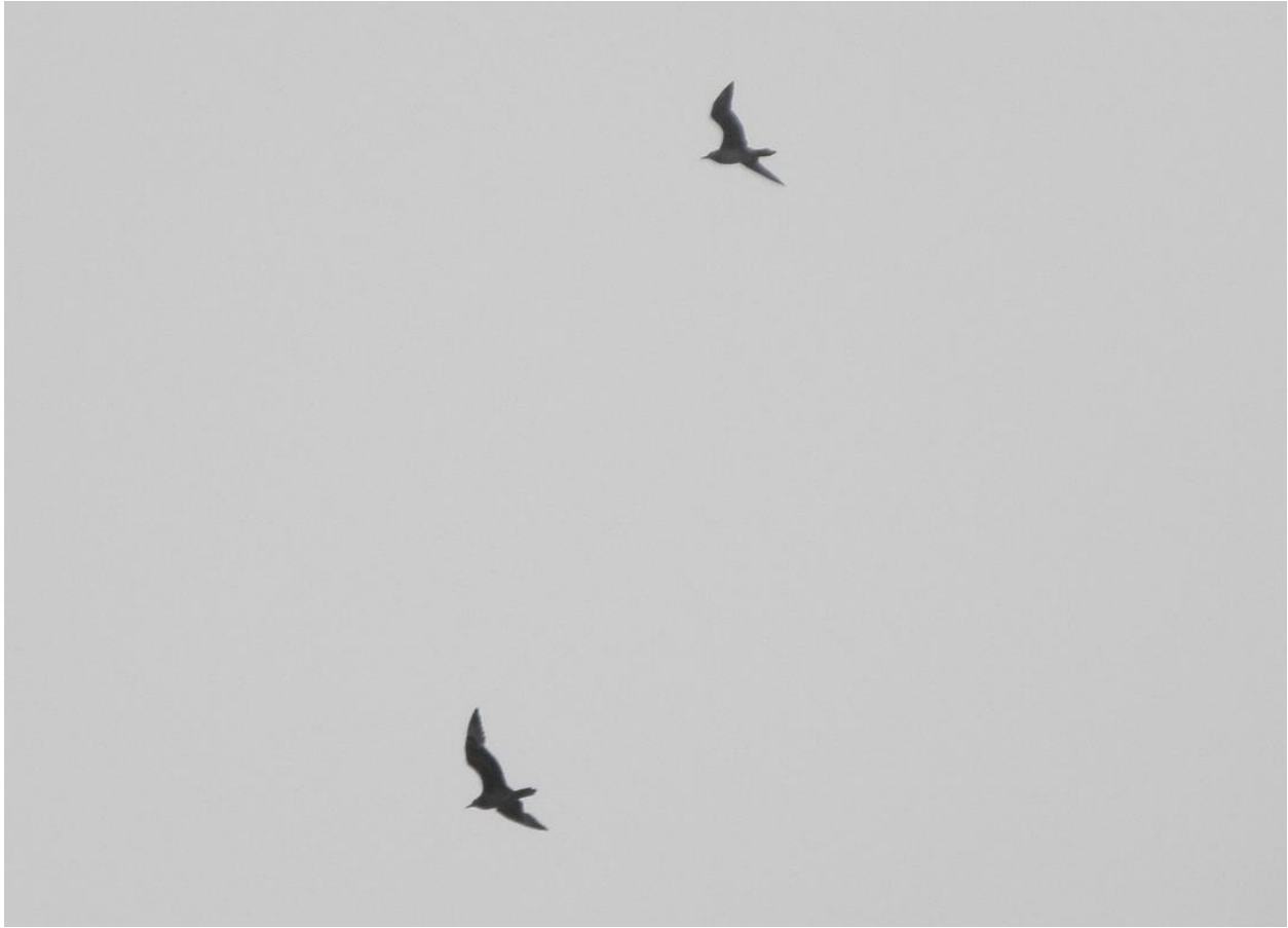
Pomarine Jaeger 10/30/2012 Delaware River at Chester, PA.