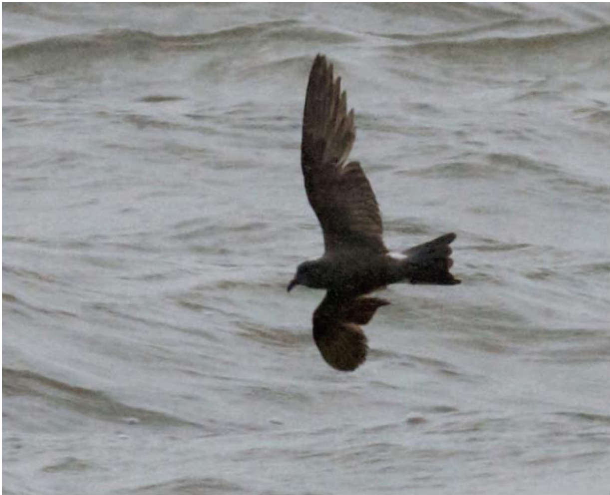
Leach's Storm-Petrel 10/30/2012 Delaware River at Chester, PA (Tom Johnson)

A total of nine Leach's Storm-Petrels were seen by several observers along the Delaware River between Hog Island Rd. in Tinicum Twp. and Chester during the passing of Hurricane Sandy . One bird was attacked and killed by a Peregrine Falcon. This species is frequently displaced by Atlantic Tropical Storms and should be watched along the Delaware River or Springton Res. by storm birders.