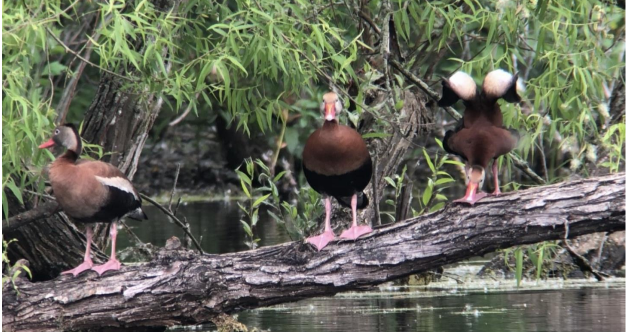
Black-bellied Whistling-Duck 6/2/2020 John Heinz N.W.R., PA

Four birds were present on Hoy's Pond in the Delaware Co. portion at John Heinz N.W.R. 6/2/20. This was a long-overdue occurrence as this species has been found in several localities within PA and nearby NJ and DE. There are two additional Delaware Co. sightings, that of ten birds at Gov. Printz Park, Tinicum Twp. and three at John Heinz N.W.R. 7/30/22. One bird was also present in the Philadelphia Co. section of John Heinz N.W.R. 7/29/23-7/31/23.