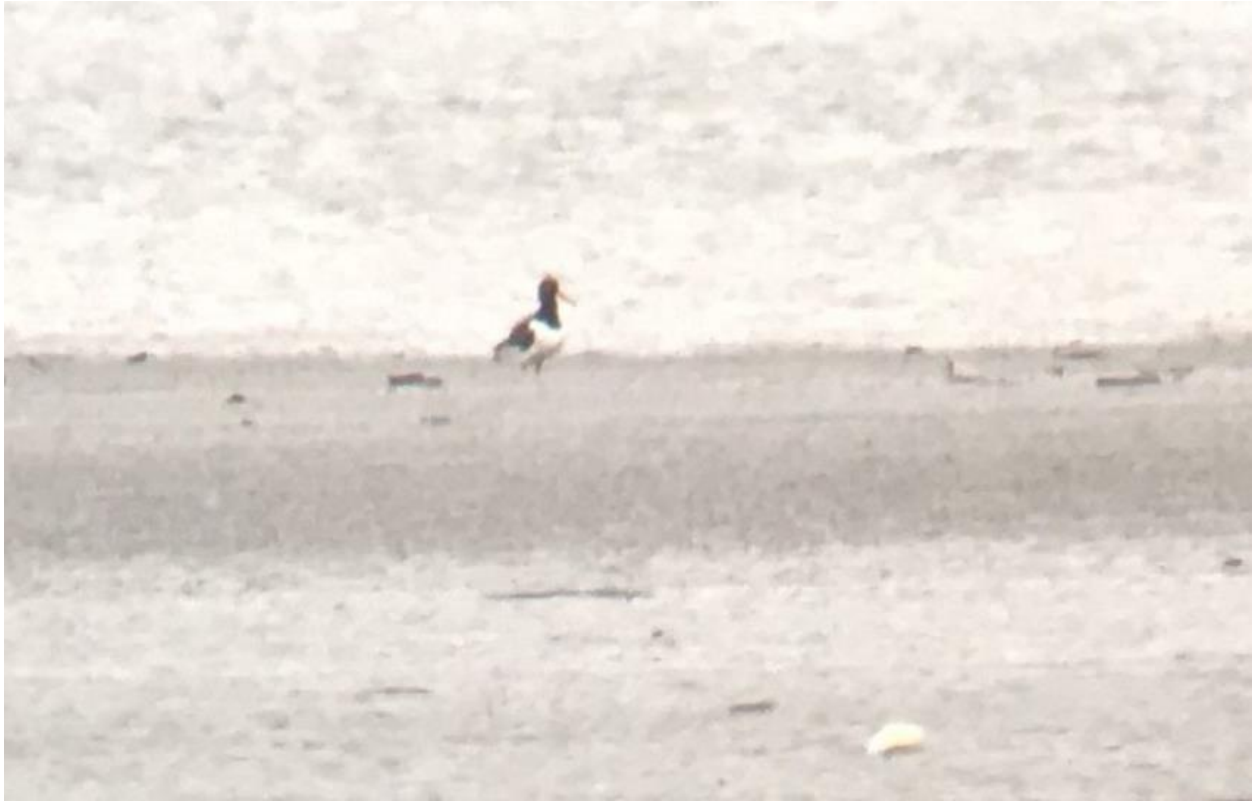
American Oystercatcher 3/24/2020 Delaware River at Hog Island Rd., Tinicum Twp., PA.