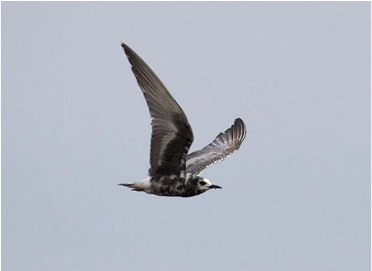
White-winged Tern 10/8/2017 John Heinz N.W.R., PA.