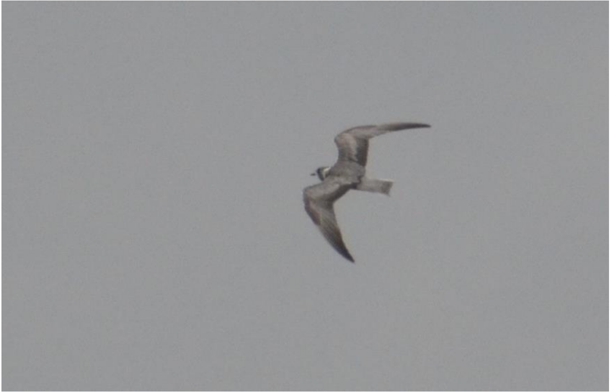
White-winged Tern 10/8/2017 John Heinz N.W.R., PA.