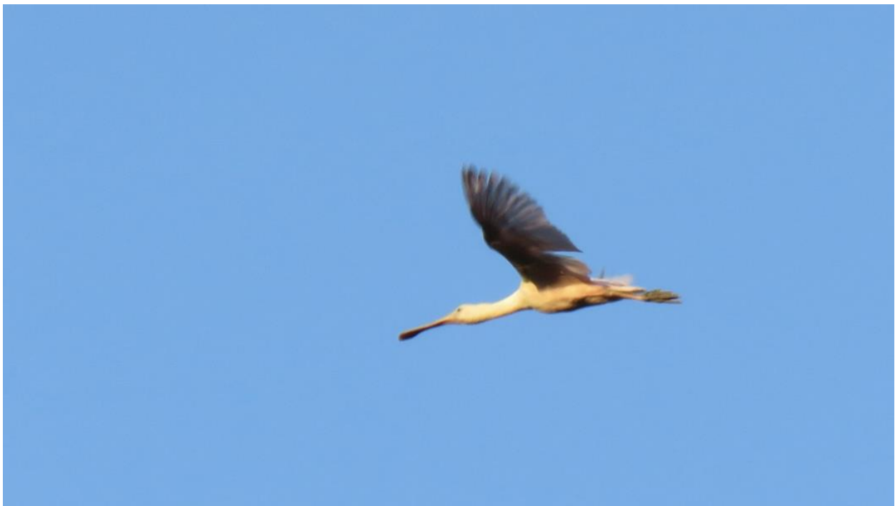
Roseate Spoonbill 7/20/2023 John Heinz N.W.R., PA.