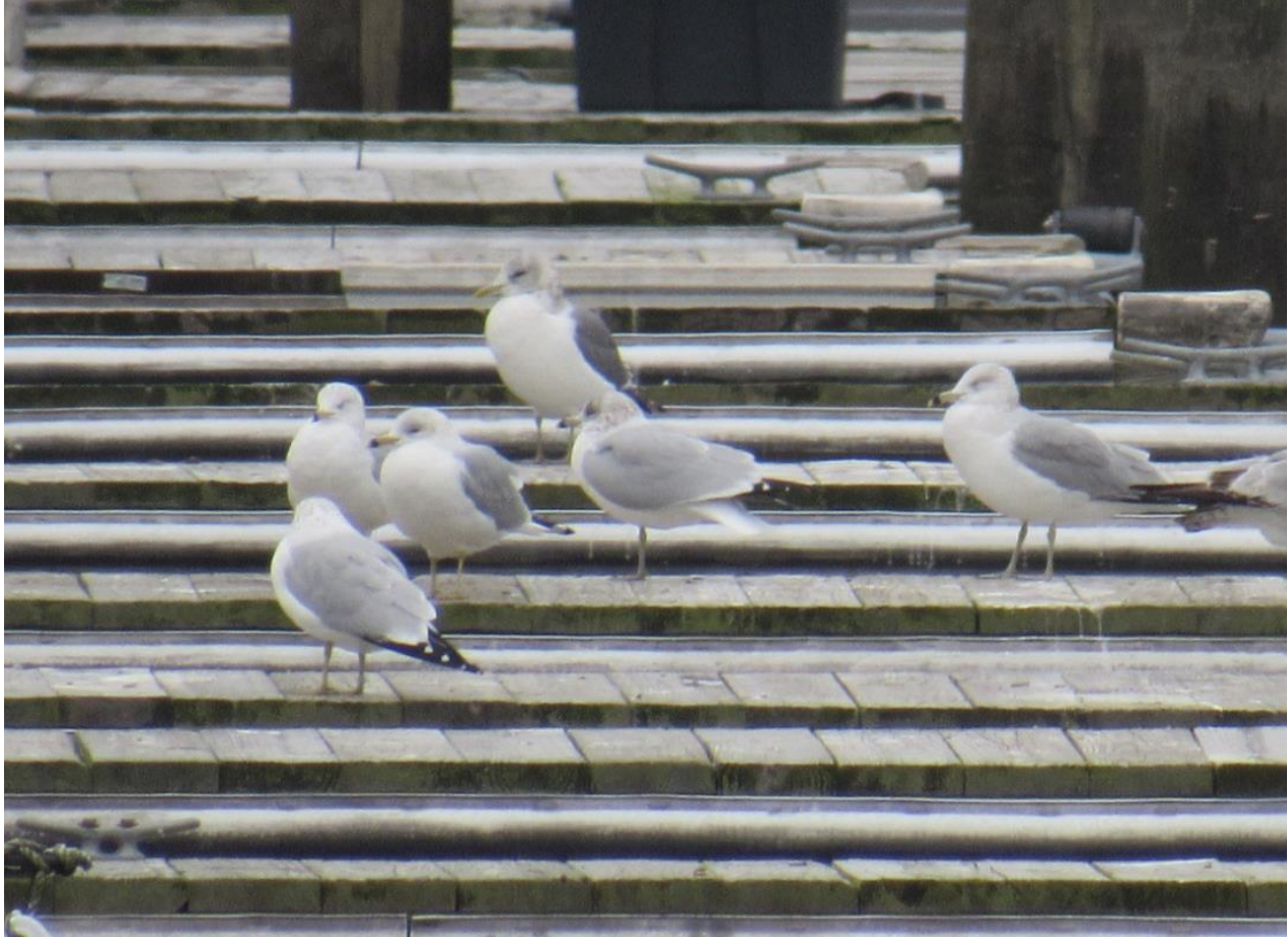
Common Gull 2/1/2020 Ridley Twp. Municipal Marina, Ridley Twp., PA.