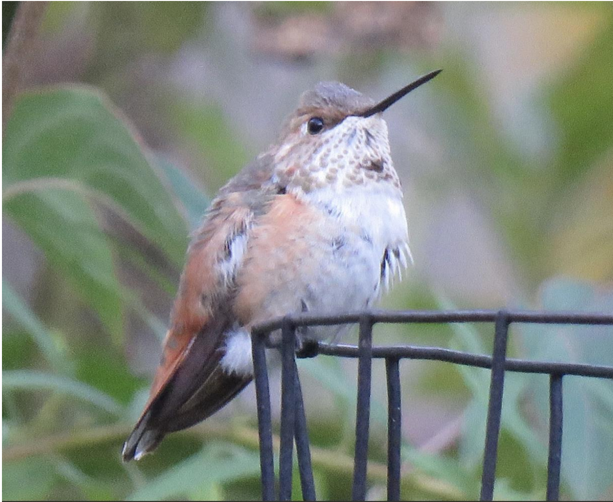
Rufous Hummingbird 10/23/2023 Media, PA ( Debbie Beer ).