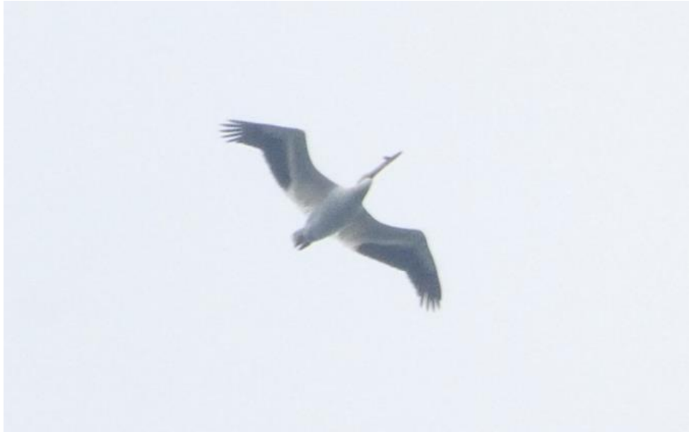
American White Pelican 6/26/2023 Glen Mills, PA.