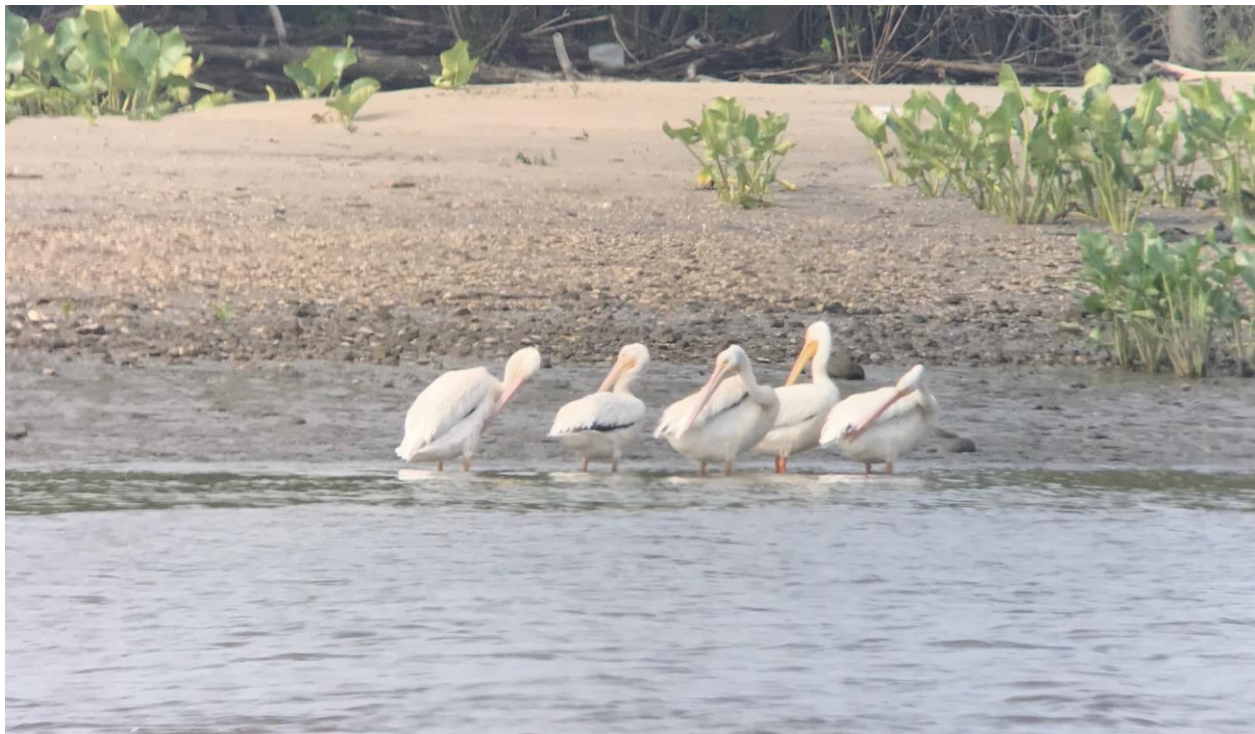
American White Pelican 6/5/2019 Delaware River at Gov. Printz Park, Tinicum Twp., PA.