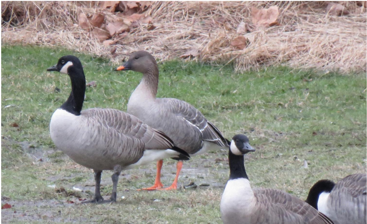
Tundra Bean-Goose 12/16/2020 Springton Lake Middle School

from many states while in Delaware County. This species is very rare in North America with most records coming from Alaska and along the west coast. Incredibly, after it left Delaware Co., it was found associating with Canada Geese in multiple locations near the Schuylkill River in Philadelphia Co. 1/9-21-1/31/21. An added bonus was that it was recorded on the Glenolden CBC 12/19/20 and the Philadelphia mid-Winter Bird Census 1/9/21.