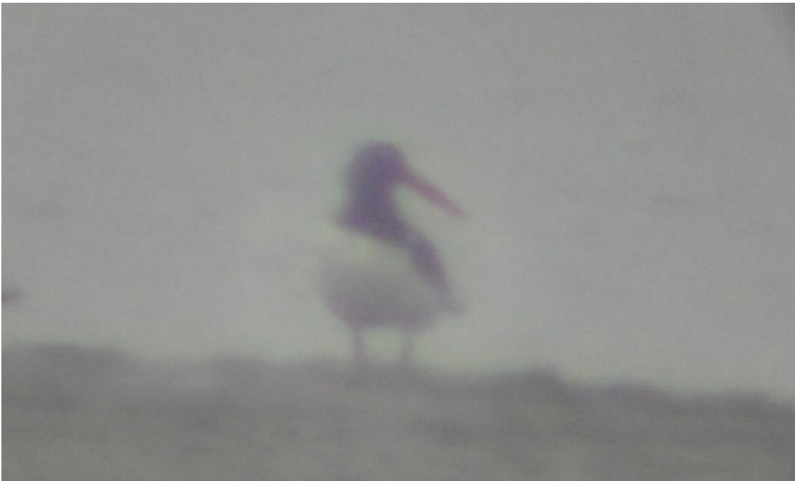
American Oystercatcher 6/2/2018 Delaware River at Hog Island Rd., Tinicum Twp., PA ( Al Guarente ).