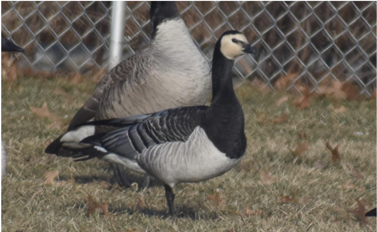
Barnacle Goose 1/16/2022 Springton Lake Middle School, Media, PA.