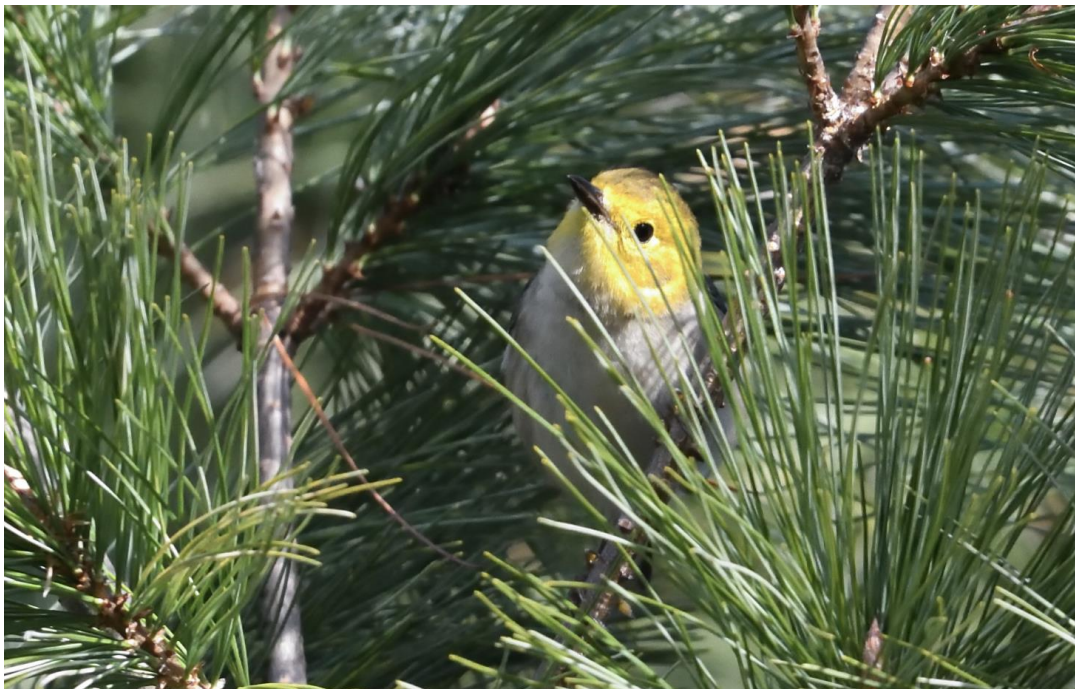
Hermit Warbler 11/29/2022 Aston, PA.