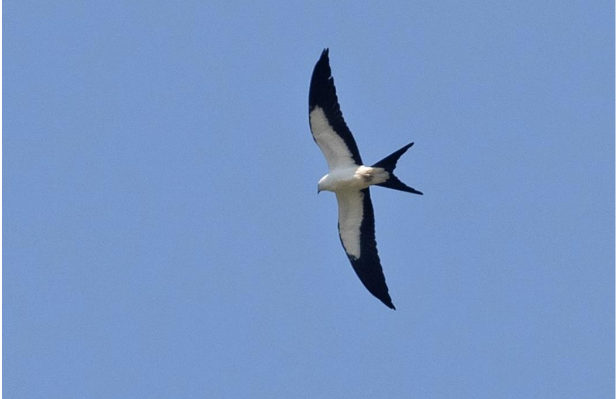
Swallow-tailed Kite 7/30/2021 Tyler Arboretum, Middletown Twp., PA ( Adrian Binns ).

One was noted in flight over Tyler Arboretum, Middletown Twp. 9/24/2008 and another was observed in the vicinity of Penncrest High School and Tyler Arboretum also in Middletown Twp. 7/30/2021-8/18/2021. The latter bird was very cooperative offering many observers great looks and photographs. This species is a rare and irregular migrant in the mid-Atlantic more frequent in Spring and should be looked for to occur again.