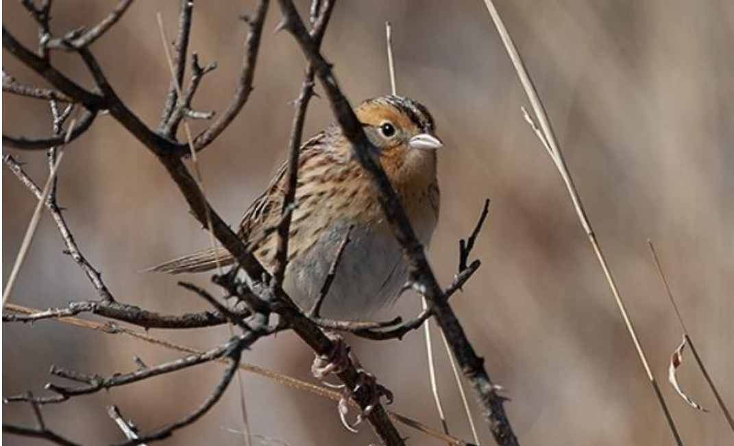
LeConte's Sparrow 1/31/2009 Darlington Tract, Middletown Twp., PA.