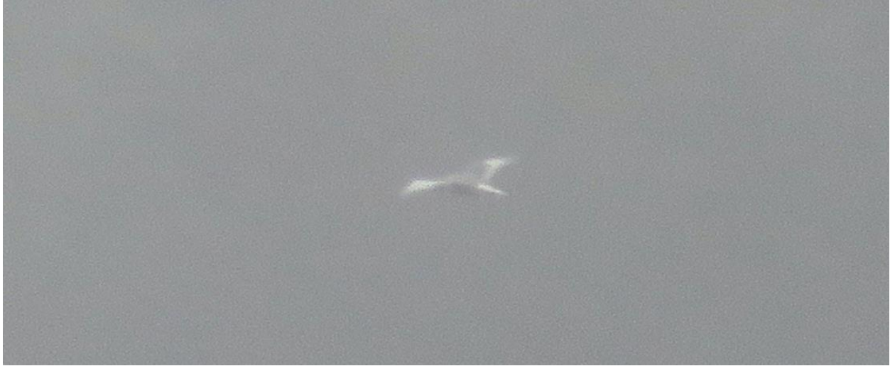
Sabine's Gull 9/24/2023 Delaware River at Hog Island Rd., Tinicum Twp., PA.