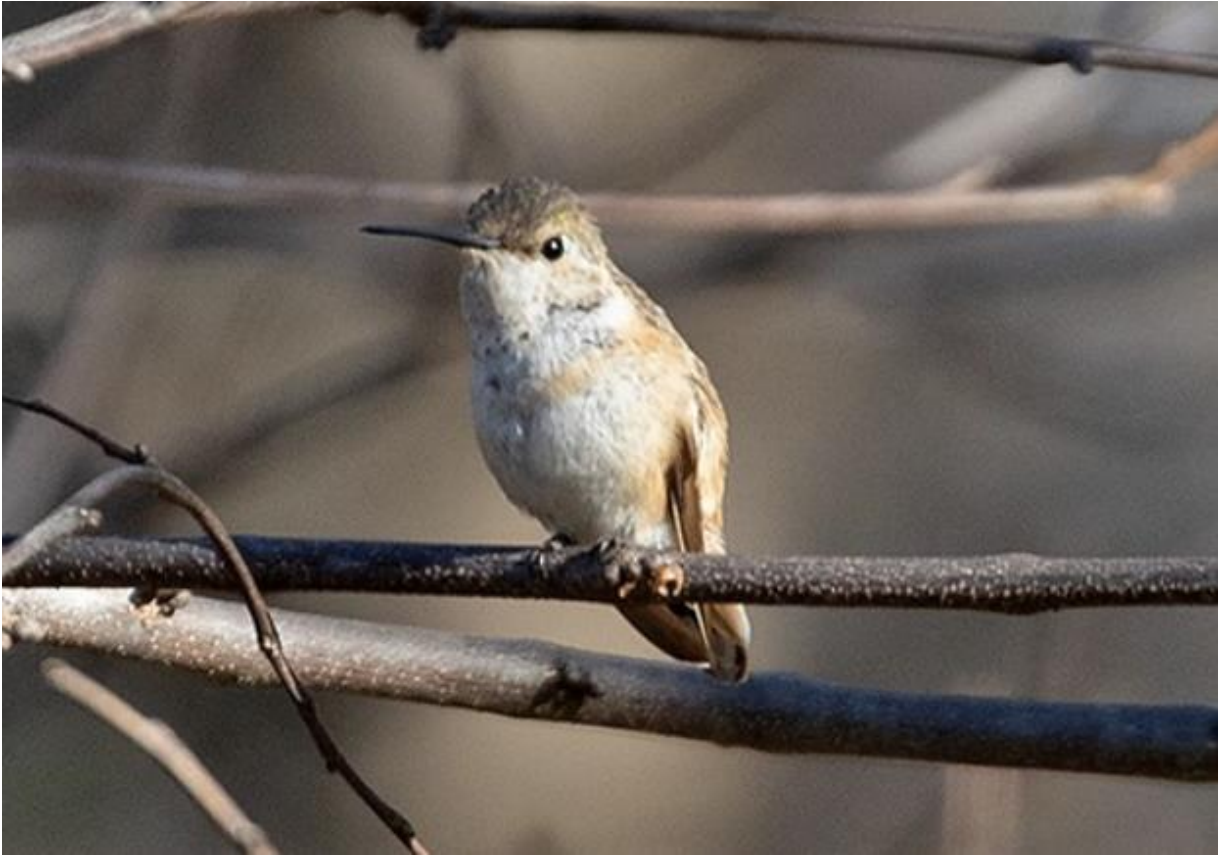
Allen's Hummingbird 12/15/2020 Springfield, PA.