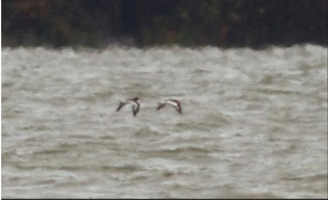
American Oystercatcher 10/30/2012 Delaware River at Marcus Hook, PA ( Doug Gochfeld ).

A surprising storm bird deposited by Hurricane Sandy along the Delaware River at Marcus Hook 10/30/2012. Even more surprising are four additional non-storm related sightings of single birds feeding on a tidal mudflat along the Delaware River opposite Hog Island Rd., Tinicum Twp. These sightings occurred on 4/15/2018; 6/2/2018; 3/24/2020; 3/29/2020. The March and April reports fall within the species' spring arrival period along the Atlantic Coast.