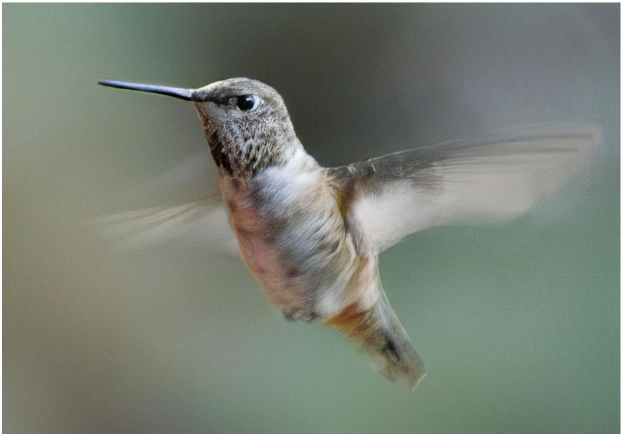
Rufous Hummingbird 11/17/2007 Swarthmore, PA.

The first Rufous Hummingbird for Delaware County was an immature female that visited a private residence in Marple Twp. 11/17/2002-12/13/2002. It was captured, identified in the hand and banded on 12/8/2002. Since that sighting, there have been six additional Rufous Hummingbirds documented. The most recent was 10/21/2023. Rufous Hummingbirds continue to be a rare and regular migrant and winter visitor in Pennsylvania and surrounding states and by keeping hummingbird feeders available during late fall and early winter to assist with their southbound migration it is inevitable that there will be more occurrences.