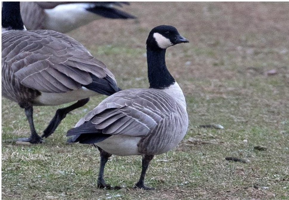
Cackling Goose 1/6/2022 Springton Lake Middle School, Media, PA.