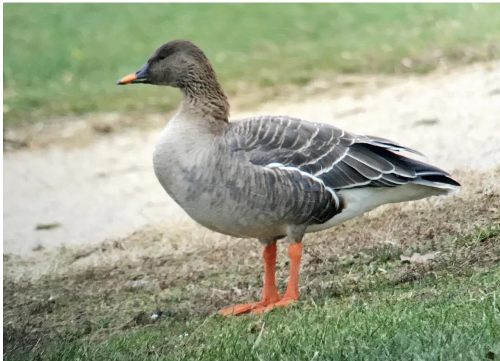
Tundra Bean-Goose 12/16/2020 Springton Lake Middle School, Media, PA.