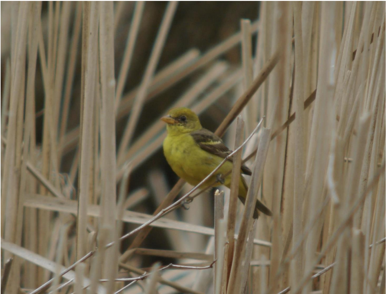
Western Tanager 4/13/2008 John Heinz N.W.R., PA.