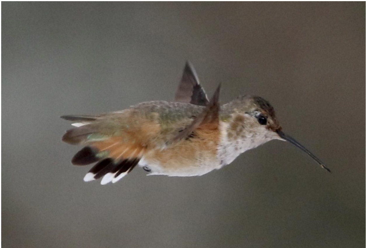
Allen's Hummingbird 12/19/2020 Springfield, PA.